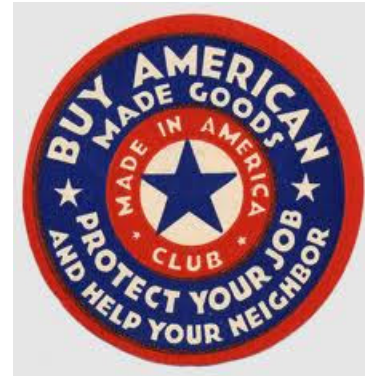
Figure 3. Buy American Act

The Buy American Act, passed in 1933, was rooted in the belief that by increasing the government purchase of domestic goods, the United States could lift itself out of the Great Depression. As its name implies, the act gave preferential treatment to the use of American-made products. Today, the act contains three original sections and two additional ones.