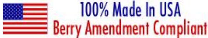
Figure 4: Berry Amendment Compliance

Another statute related to the government procurement of foreign goods is the Berry Amendment. While the Buy American Act gives preference to domestic products over foreign